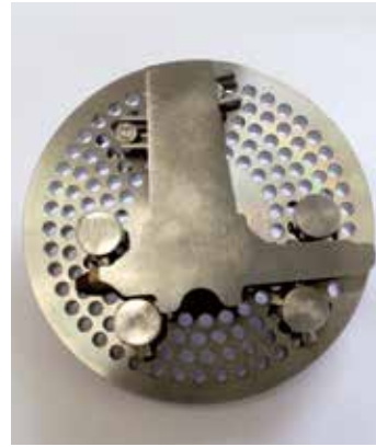
Examples for application