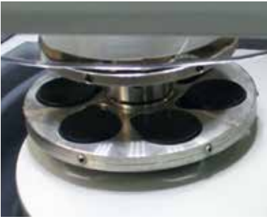
Central pressure requires levelled samples