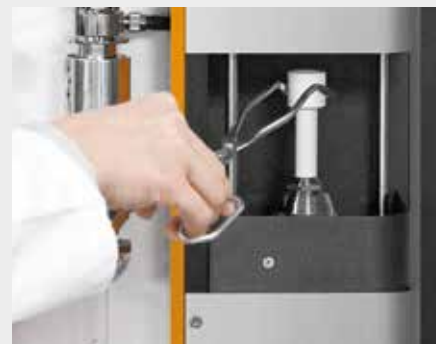
Introducing the sample