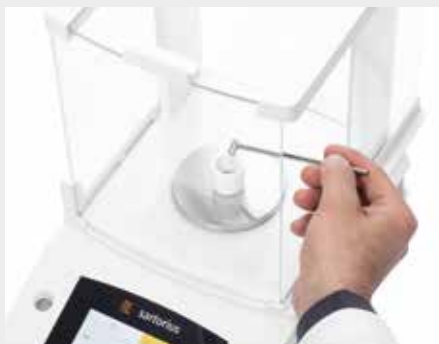
Weighing the sample

weighed and logged into the software, all further steps happen automatically once the analysis is started. The results are available within minutes.