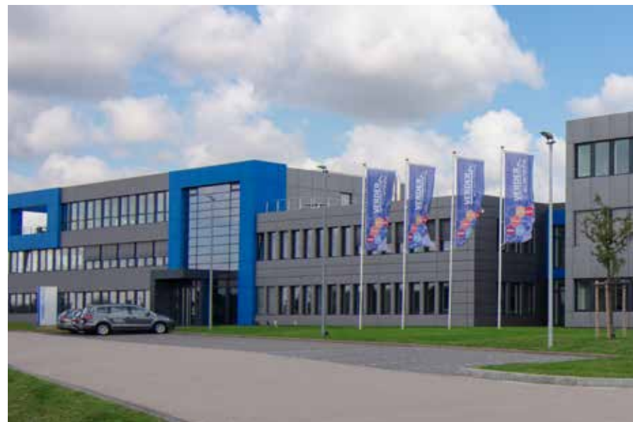
Eltra GmbH in Haan, Germany

ELTRA is part of the Verder Group since 2012 and consistently invests in research and development. With the introduction of the ELEMENTRAC series with powerful ELEMENTS software ELTRA offers analyzers for rapid and reliable O/N/H and C/S determination. These are characterized by modern design, convenient operation and integrated solutions for special applications, like our Dual Furnace Technology which allows analysis of both organic and inorganic samples with only one instrument – a unique concept only provided by ELTRA.