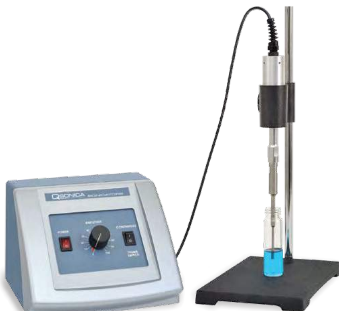
Stand sold separately.