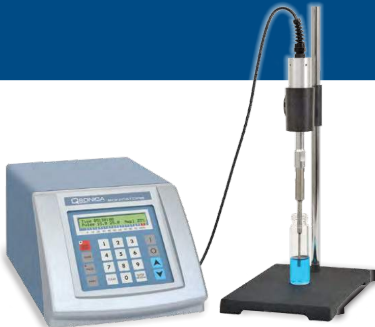
Stand sold separately.

The unit is effective for standard cell disruption, DNA/RNA shearing, homogenization and many other applications. The Q125 is ideal for small samples and for customers that do not plan to scale up to larger volumes in the future. This model offers the same programming and display features as the Q500 unit.