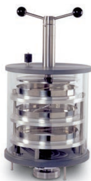
Large capacity stoppering chamber