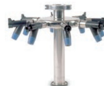
8 port manifold