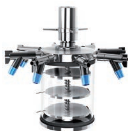
Standard stoppering chamber with 8 port manifold