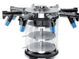
Standard chamber with 8 port manifold