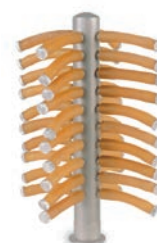
40 port manifold