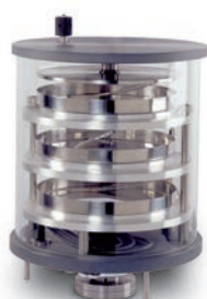
Large capacity chamber